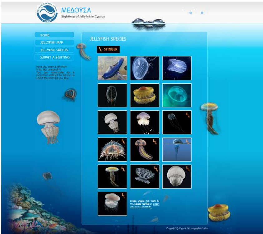
Figure 2. Description of the species of our interest in the webpage created by the Oceanography Centre (Source: http://www.oceanography.ucy.ac.cy/medusa/species.html ).