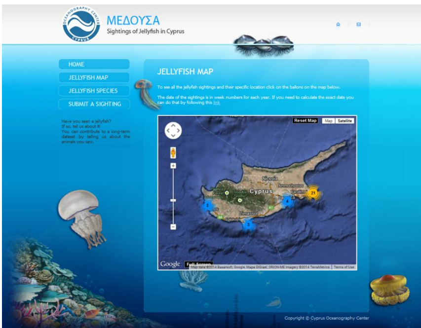
Figure 3. Map display of recorded species of jellyfish in the marine area of Cyprus, reported with the help of citizens. (Source: http://www.oceanography.ucy.ac.cy/medusa/jellyfish_Map.html ).