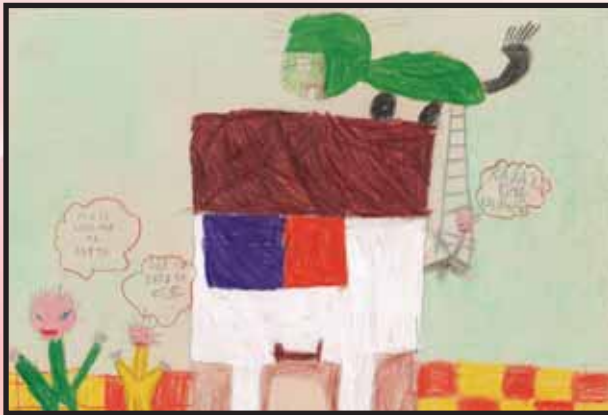
Boy- 5th Grade