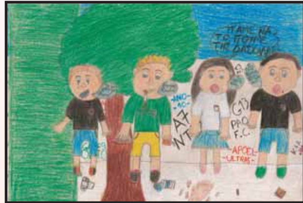
Boy - 5th Grade