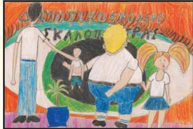
Girl - 5th Grade

What would you do if Demetris was your younger brother?