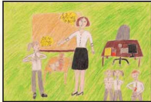
Girl - 5th Grade