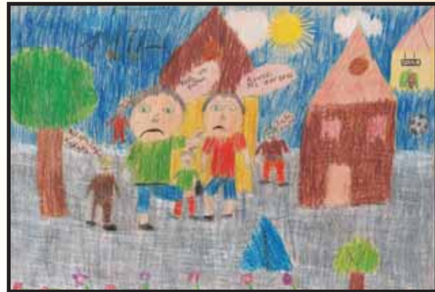
Boy - 5th Grade