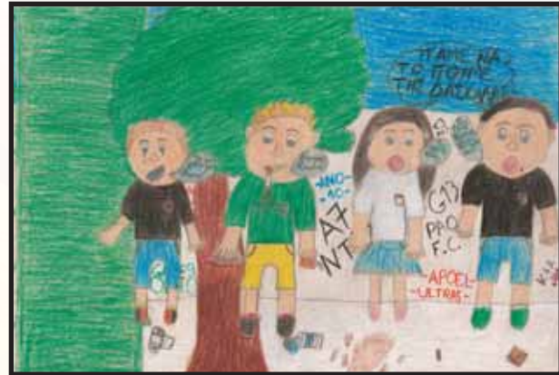
Boy - 5th Grade