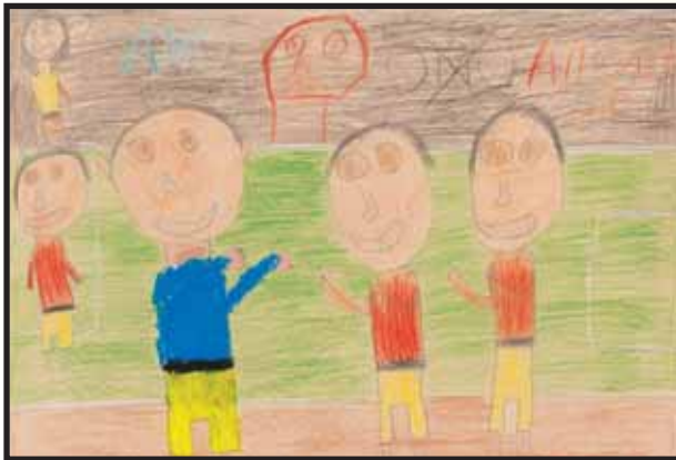
Boy - 5th Grade